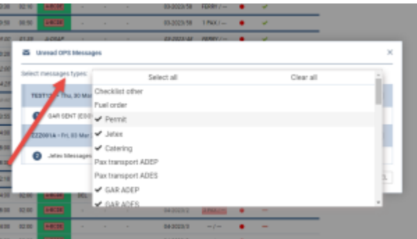
'Message Center' multi-select

There is a possibility to multi-select what kind of messages should be visible on the dashboard. Click on the 'Select messages type' drop-down menu in order to manage messages displayed on the screen. This will affect all places where messages can be launched and has an impact on the number of unread messages.