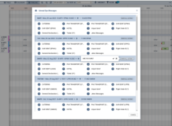
'Message Center' view

Message Center is available in all the OPS views - Table, Calendar, and Timeline.