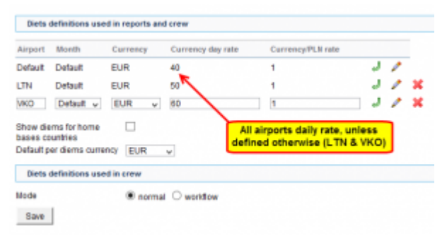
Per Diems - mode 'Normal'

In this mode you can see columns such as: