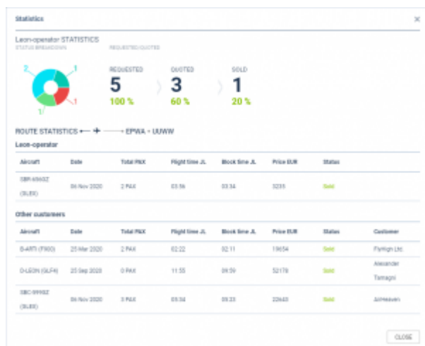
'Show Statistics' window

Show statistics option is available from: