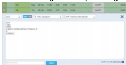
GCR message example - flights on different days