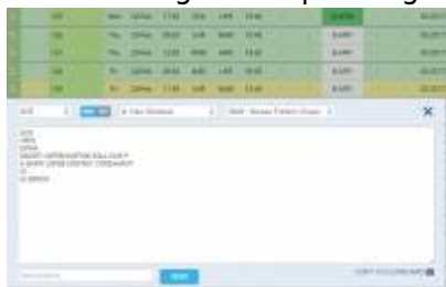
GCR example - flights on the following days