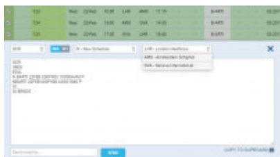
GCR message example - flights on the same day

Single message may include requests on as many flights as needed given that all those flights take place on the same calendar day. The GCR message only uses ICAO codes for aircraft and airports and displays UTC times only.