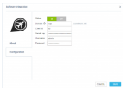
Scandlearn in the Add-ons panel

Scandlearn is the ultimate all-in-one crew training solution for companies, organisations and authorities, at any size, including the ones in the aviation industry.