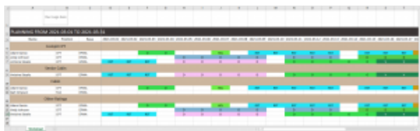
Excel file new layout

We have amended the layout of the excel file to which the Calendar is printed.