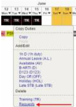
Rejecting crew duty request

Before this change, crew were able to make requests in the Duty Roster only for days without assigned duties.