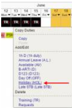
Accepting crew duty request