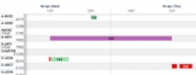
Reservation in Crew Panel

It is now possible to show aircraft Reservations in the top section of the Crew Panel. This can be activated by going to the SHOW section under the three-dot icon in the top right corner of the page.