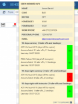
Crew currency status in Crew Panel

Functionality to show Crew currency has been added to Crew Panel.