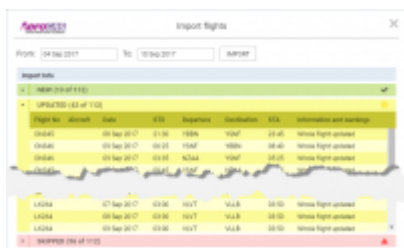
Import Flights from AeroCRS

Once it is active, you can start importing flights from AeroCRS.