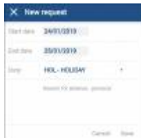
Adding new request

We have added an option enabling the crew members to request duties via the Mobile App. The request will immediately on the Crew roster, so that the Crew Planner can either accept the request or reject it.