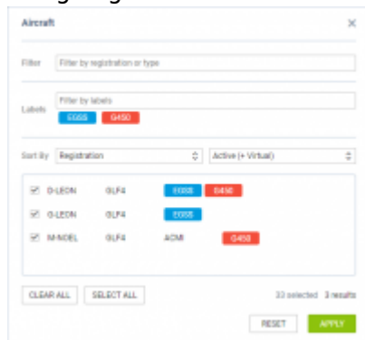
Filtering Aircraft by label

It is also possible to filter aircraft by label .