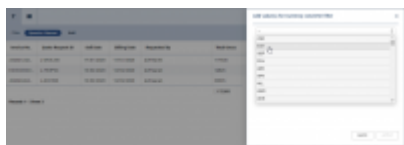
Currency Converter Filter