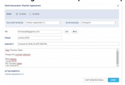
Charter Agreement sending form

We have improved workflow in Requests/Quotes. We have changed the way of selecting a quote you want to work on - now it is the selected aircraft that represents the quote and the quote becomes a default quote for further proceeding.