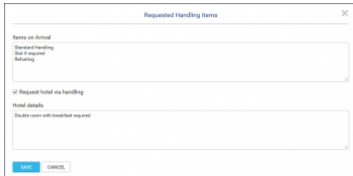
Requested items and Hotel window