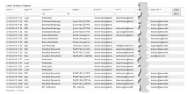
Leon Outbox report

Leon Outbox Report allows you to view details of any notifications that were sent from Leon. This is very helpful when a notification email did not arrive and you would like to check if it was actually sent.